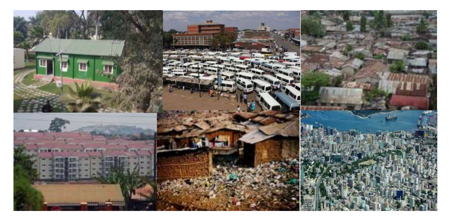
HUDCO'S HUMAN SETTLEMENT MANAGEMENT INSTITUTE ITEC International Training Programme on 'Formal Solutions to Informal Settlements' 20<sup>th</sup> March 2023–14<sup>th</sup> April 2023