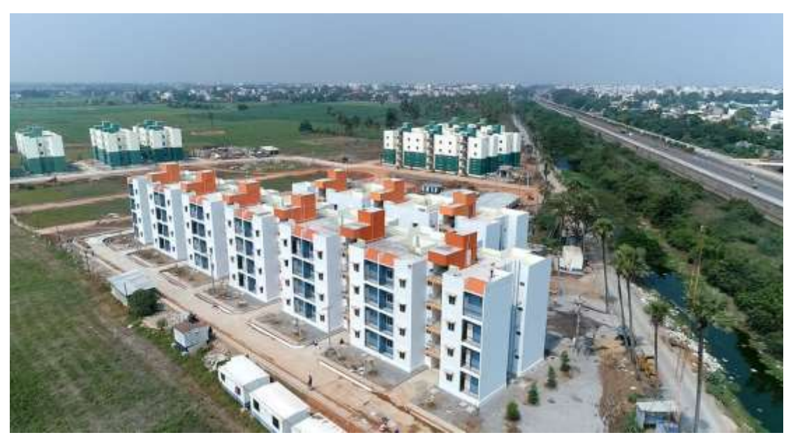
Affordable Housing under PMAY at Tenali- HUDCO Project

The mobility options and access to basic services is essential for the efficient functioning of our cities and towns, as they expand. The issues of multimodal transport options, urban livelihoods and financial inclusion through micro-finance have been addressed and discussed. The use of Information and communication technology for connectivity and security in human settlements is crucial for the growth of digital India. Effective formal solutions are crucial for the success of urban development particularly in metropolitan areas. The role of government is of a facilitator for improving the affordability of various alternatives of structurally safe housing typologies, adhering to planning norms and establishing linkages with the city infrastructure services. There is a need to develop processes and tools to protect the social, economic and cultural fabric of the people who have been living in informal settlements. The course on "Formal Solutions to Informal Settlements" looks into these challenges of informal settlement and the various interventions including innovative solutions to deal with such issues being faced by most of the cities of the developing world.